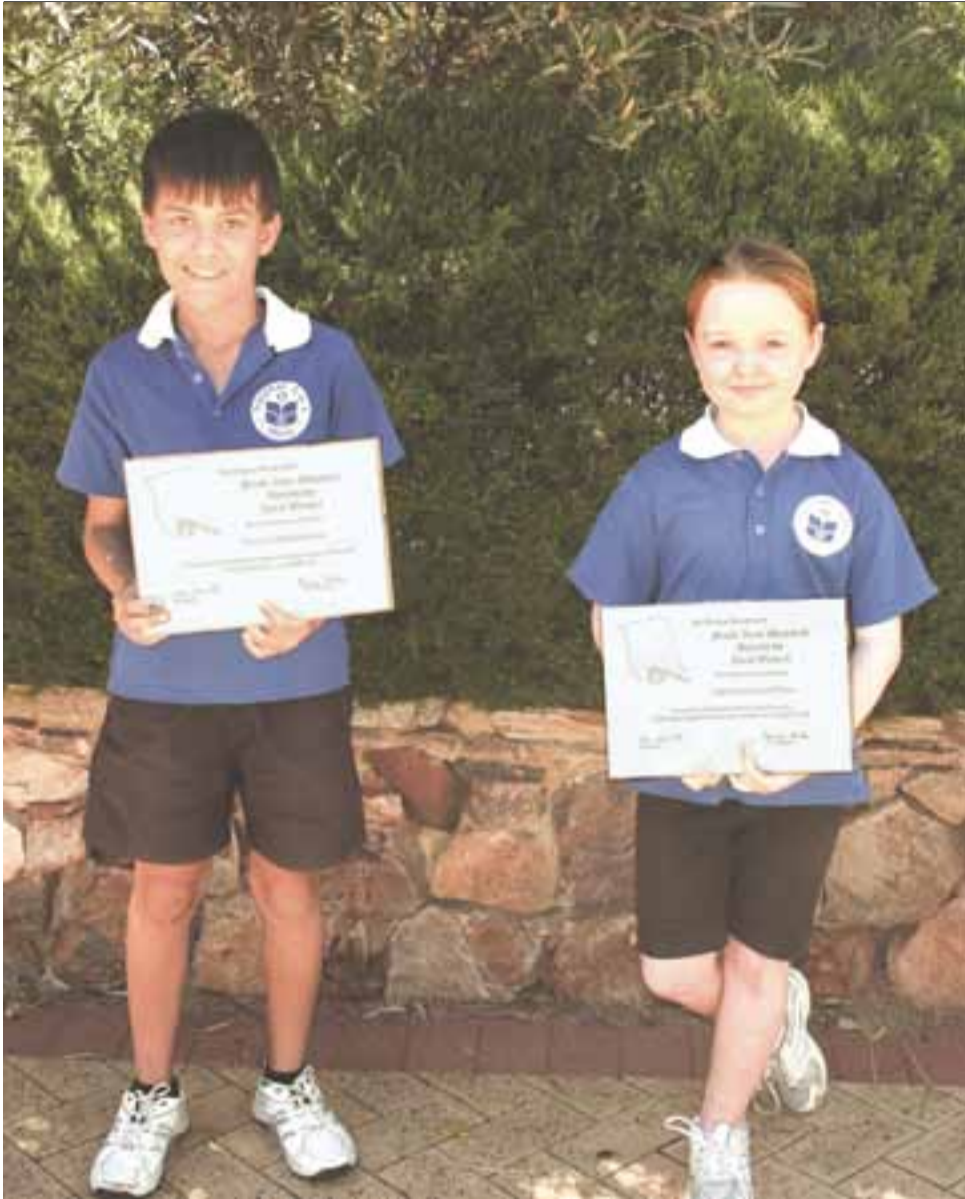
Junior winners of the Frank Venn Awards