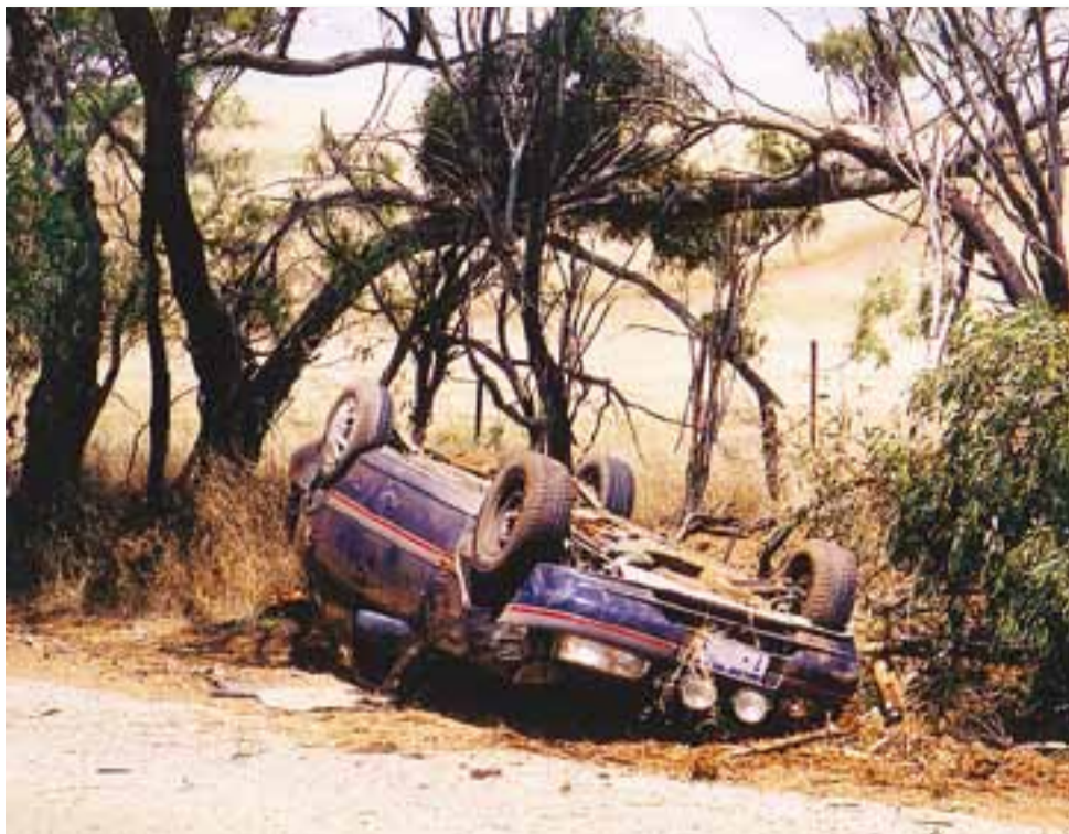
Spotted on Coondle West Road

A NUMBER OF photographs and letters have been submitted this month about fires, accidents and other safety issues in Toodyay. The Herald urges all residents to be aware of road and bushfire safety this Christmas and wishes all our readers a safe and happy holiday season.