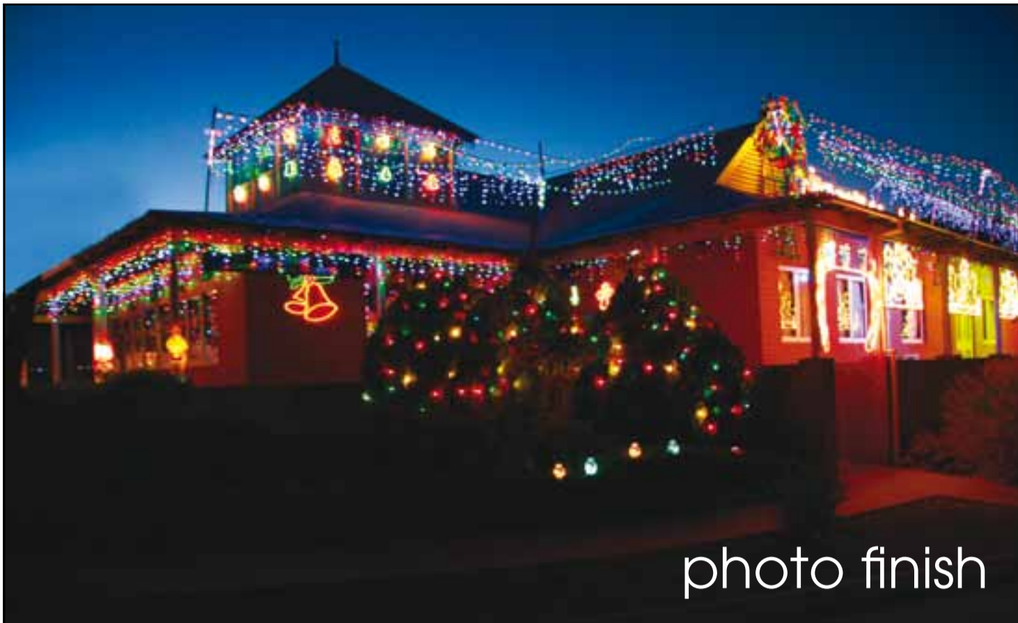
THIS magical photograph of the Alma Beard Community Health Centre